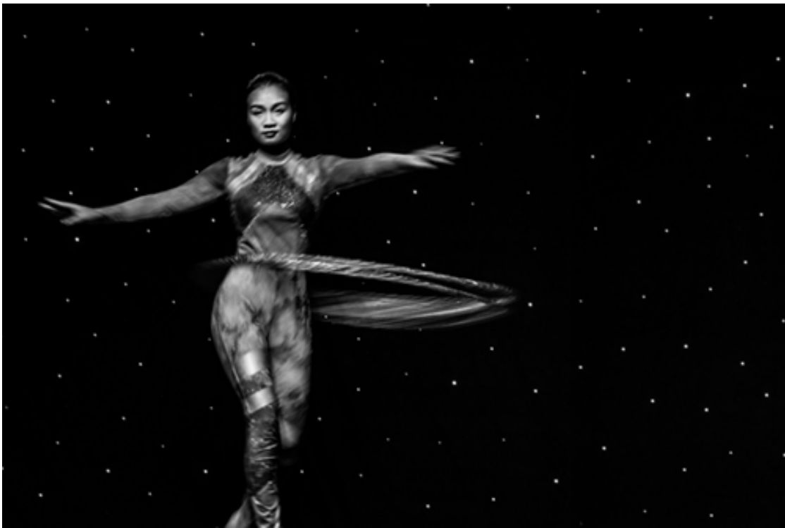
“Hooper” photography, various sizes

The dancer gracefully crosses the stage; her fluttering hands and the synchronized hoop revolutions are evident. Arrested movement contributes to a 3-D quality.