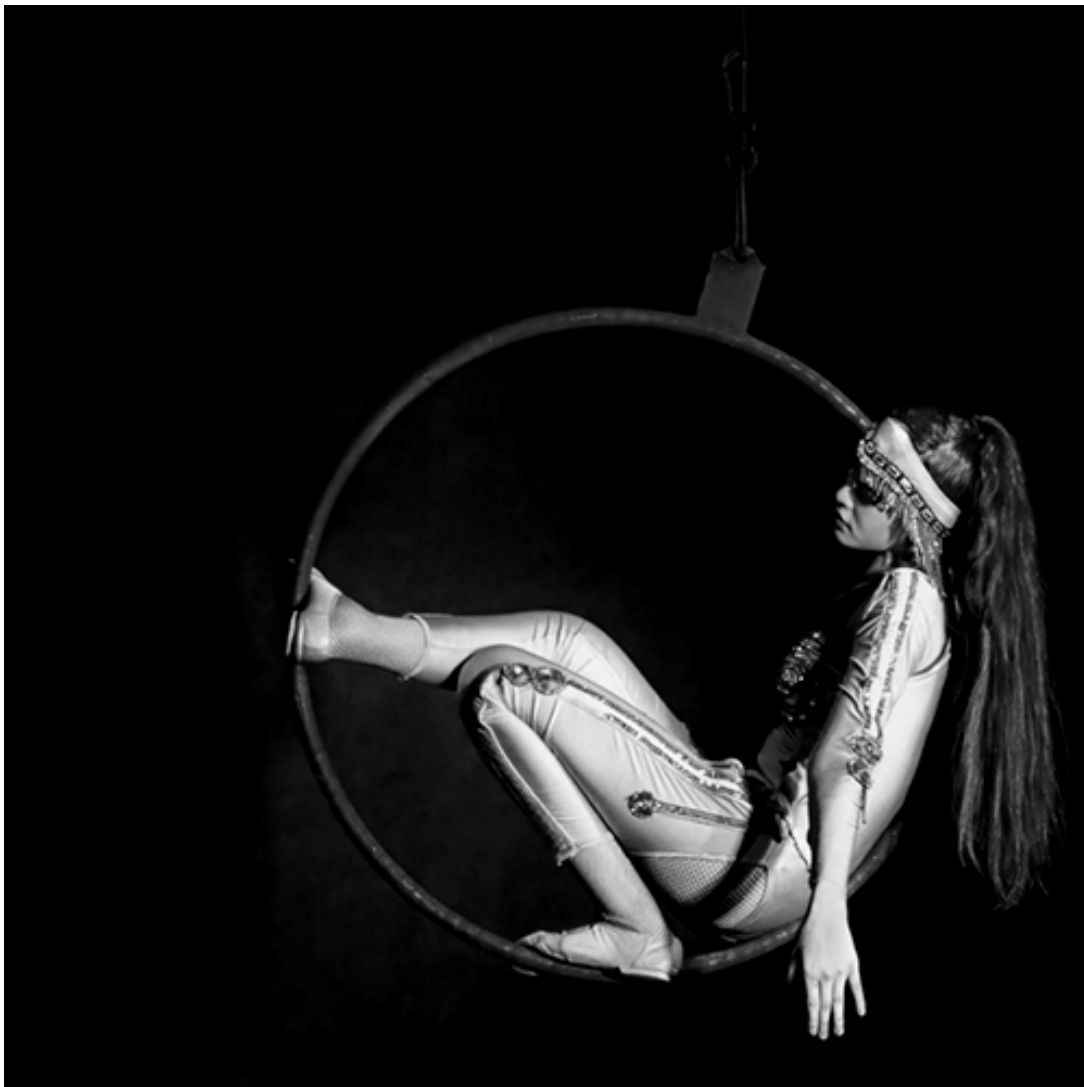
“Pushing the Boundary” photography, various sizes

I make eclectic and unconventional digital photographs. There is joy in choosing the lens, technique, perspective and crop. I strive for high impact and clean, fresh design.