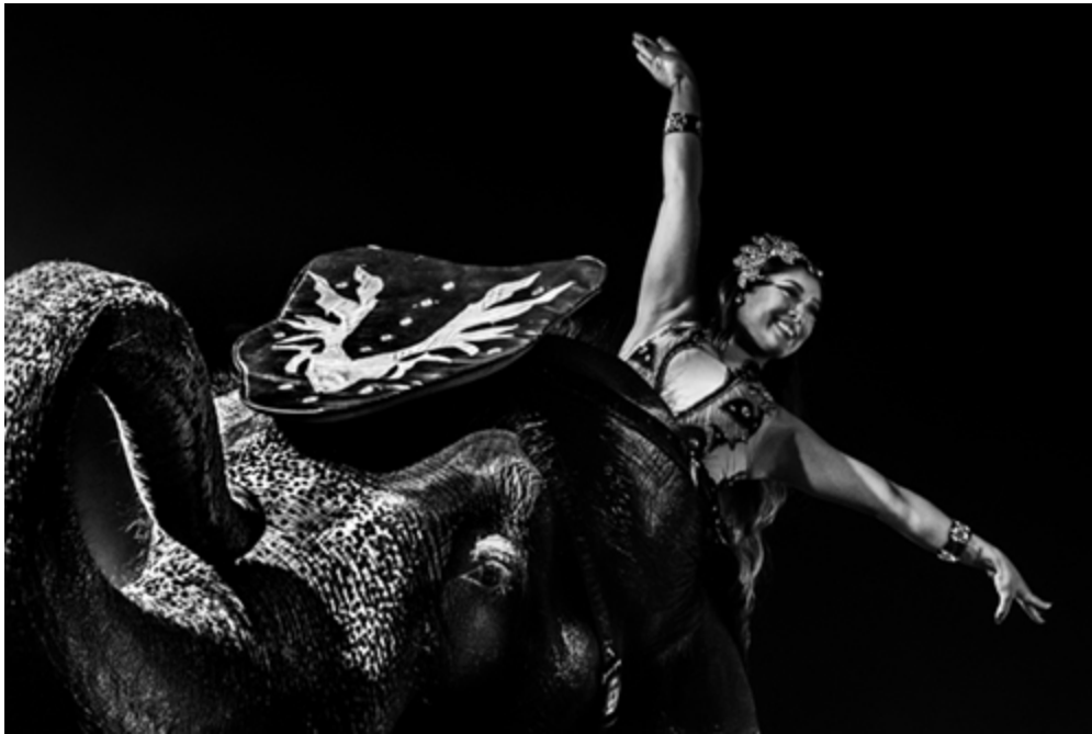
"The Lady and the Elephant" photography, various sizes

An unusual camera angle and juxtaposition of dissimilar and misdirected subjects can make a photo distinctive.