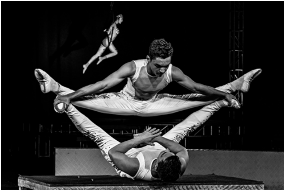
“Strength, Balance and Grace” photography, various sizes

A symmetric image is perfectly balanced. However, I prefer asymmetric images; they have less predictability, more visual tension and encourage greater scrutiny.