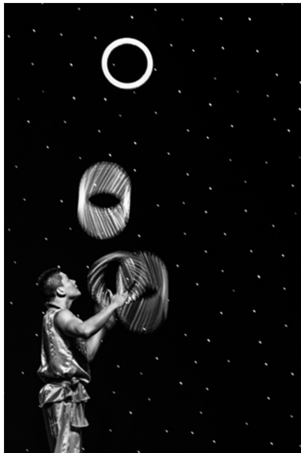
“King of Rings” photography, various sizes

A symmetric image is perfectly balanced. However, I prefer asymmetric images; they have less predictability, more visual tension and encourage greater scrutiny.