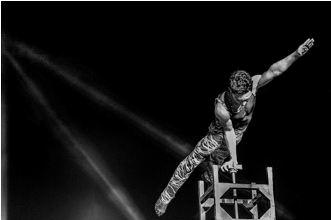
“Strong Man and Light Beams” photography, various sizes

The dancer gracefully crosses the stage; her fluttering hands and the synchronized hoop revolutions are evident. Arrested movement contributes to a 3-D quality.