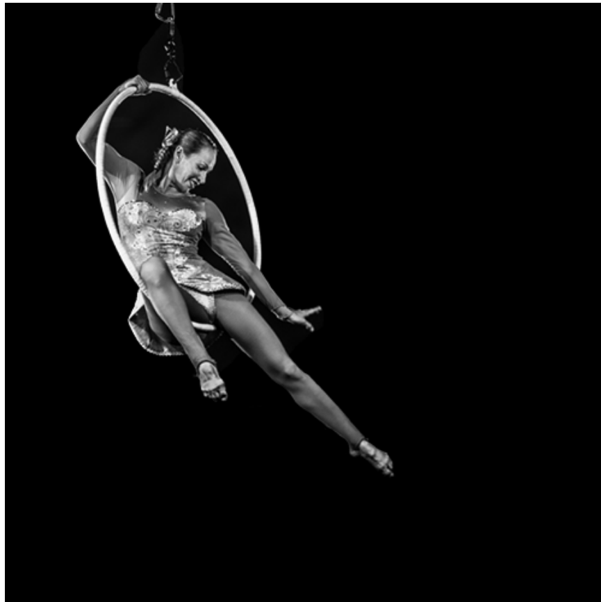
"Side Saddle" photography, various sizes

I'm delighted when I can record a decisive moment or fleeting occurrence. For example, capturing movement only in the swishing mock sword and quivering hand, but nowhere else.