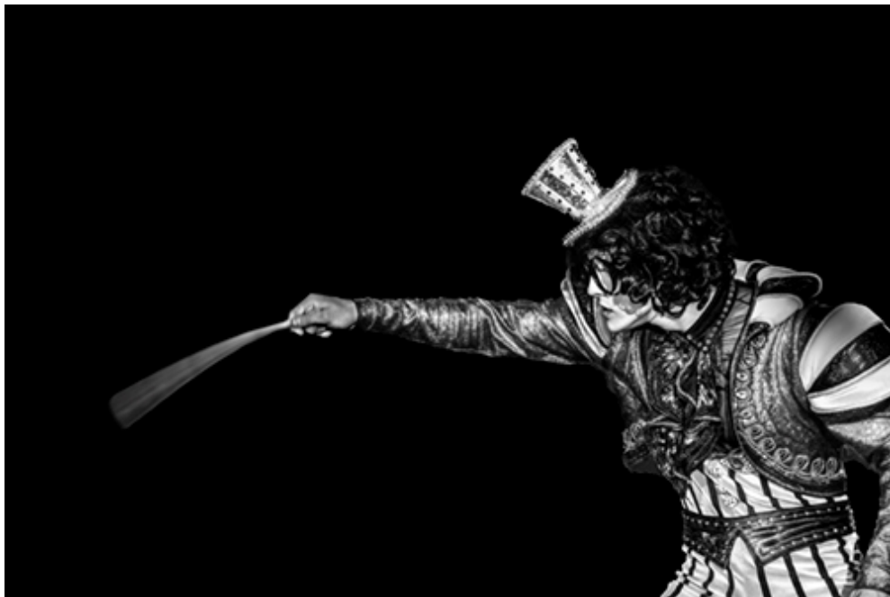
"En Garde!" photography, various sizes

I'm delighted when I can record a decisive moment or fleeting occurrence. For example, capturing movement only in the swishing mock sword and quivering hand, but nowhere else.